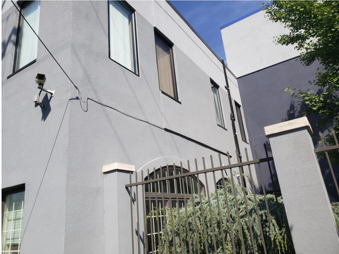
Aerial Drop to the Building