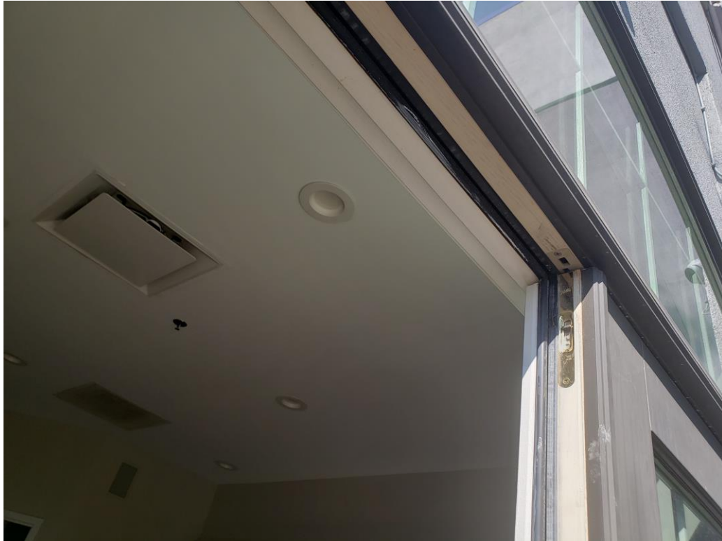
Pull fiber through ceiling